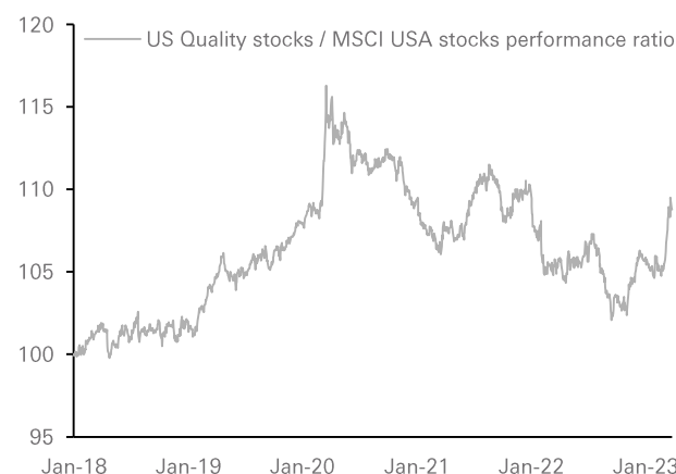
Chart 3: Focusing on quality has helped a lot in the past few weeks

Source: Bloomberg, HSBC Global Private Banking as at 27 March 2023. Past performance is not a reliable indicator of future performance.